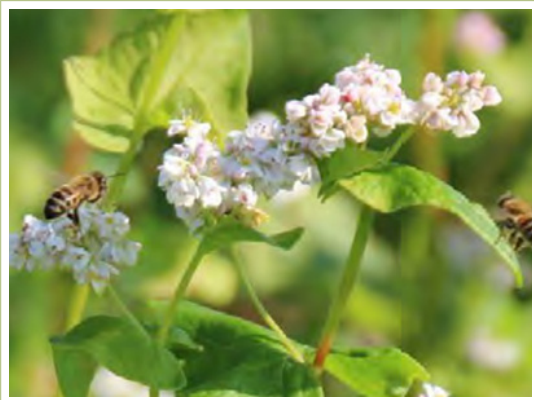
Coccinelle – bees on blossom