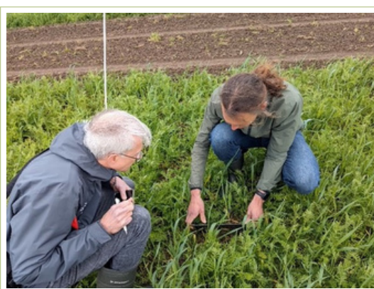
Exchange partners from Denmark and Switzerland