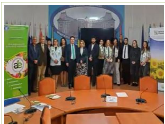
SWOT Analysis Workshop with the Ministry of Agriculture and Rural Development

Bio Danubius is an ambitious project working with farmers across the Danube delta in the far east of Romania, bordering Ukraine. The region has a strong identity as a natural park, so this innovation hub is building on this reputation by creating a voluntary certification system, Bio+, focusing on organic and agroecological farming principles, ensuring these high standards are recognised and rewarded appropriately.